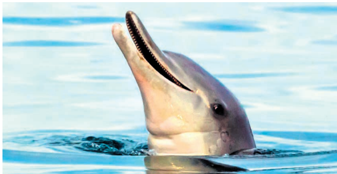
This youngster gave a toothy 'spyhop' for the researchers