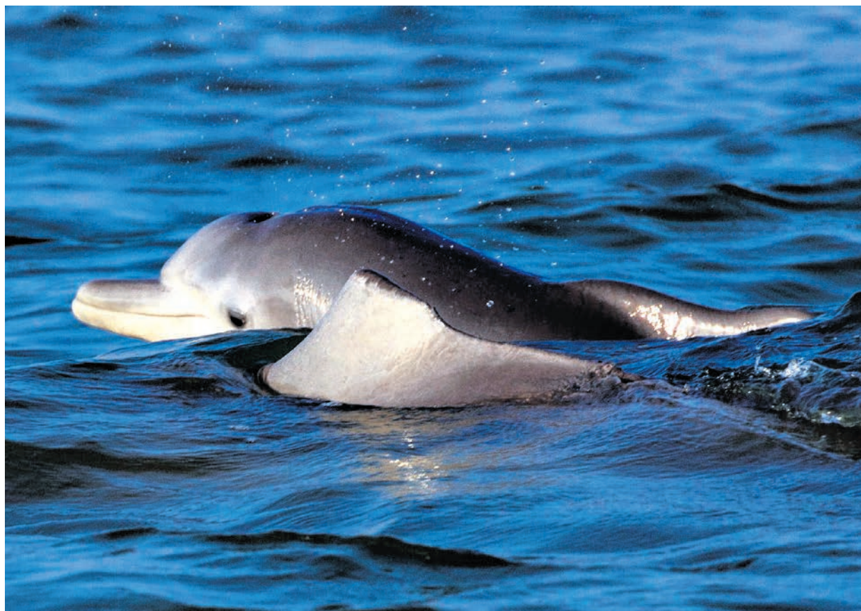
The dolphin known as G'n fin, seen over the weekend with her new baby

We followed the dolphins from the New Mouth area all the way into the port. They swam far into the harbour, past the Cassuarinas into a restricted area which meant that we had to leave them, but not before taking a spectacular photo of a playing youngster spyhopping and showing us a toothy grin.